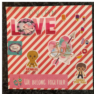
Second Place: Dylan